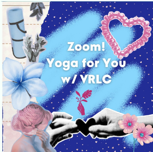
Above: Graphic designed and provided by MOTA